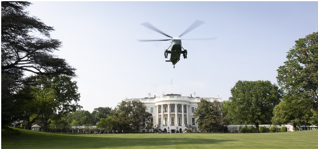
Marine One.